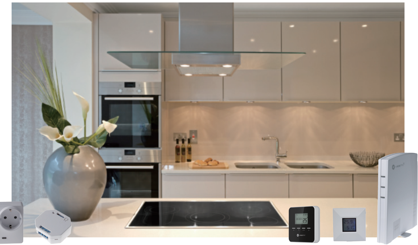
Adopting the ZigBee Pro HA 1.2 standard, the HPGW-G is compatible with ZigBee devices from other manufacturers.

Advanced ZigBee and Z-Wave solutions automate your home and animate your everyday life.